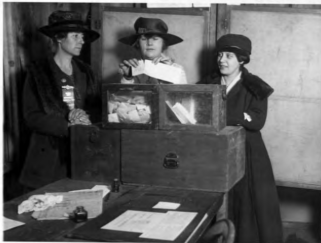
Suffragists casting votes in New York City

Email: ONEONTA@UUPMAIL.ORG http://organizations.oneonta.edu/uup